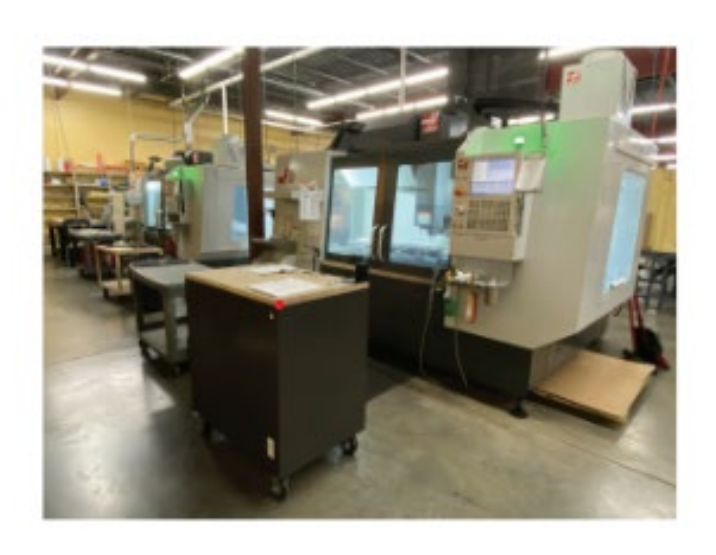
New milling machine for sign making.