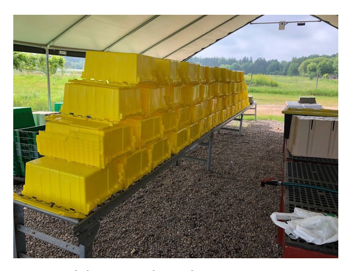
Reusable CSA distribution totes drying after being washed with pressure washers.